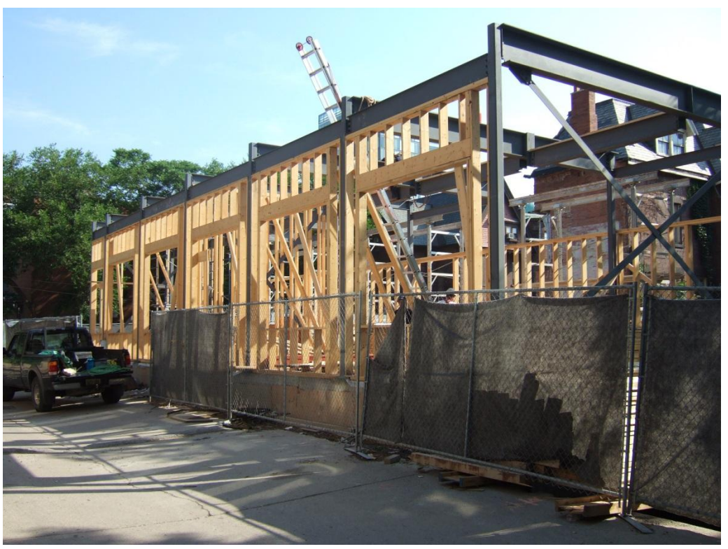
First floor conference rooms looking NE from bpnichol lane 9 July 2007