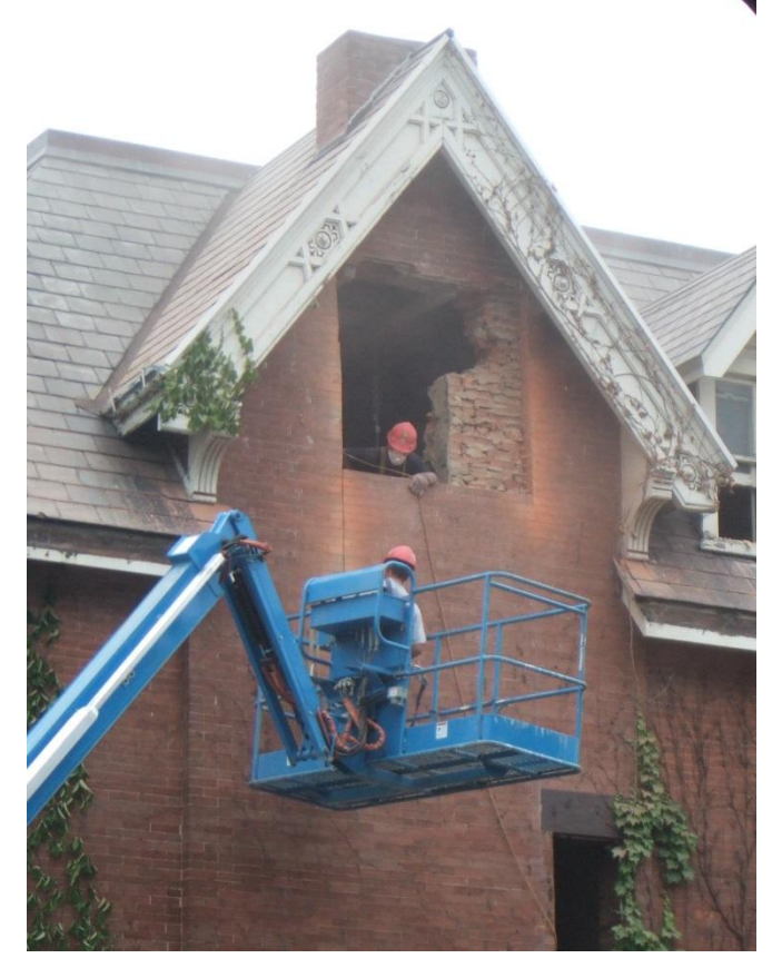
Crowther House, north side 19 June 2007: Cutting 3<sup>rd</sup> floor passage through a chimney to new north wing.