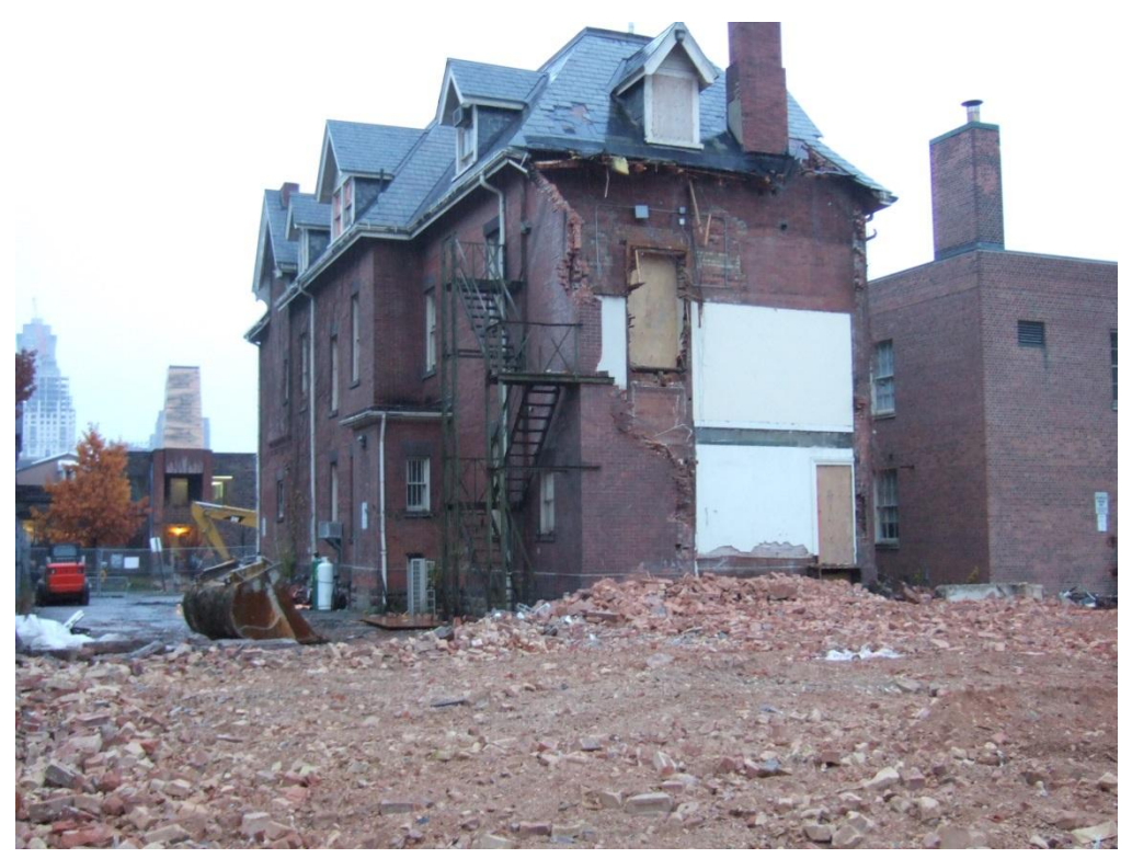
The original house after demolition of the 1920's addition and the coach house, looking east from the bp nichol laneway.