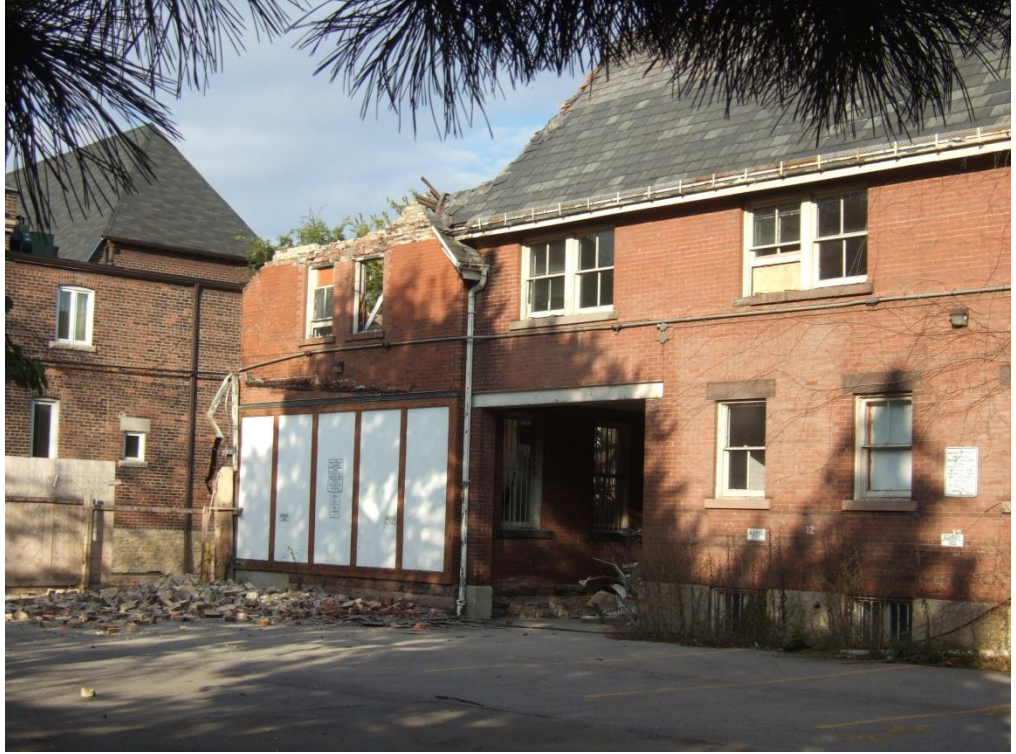
Coach House roof off looking NW.