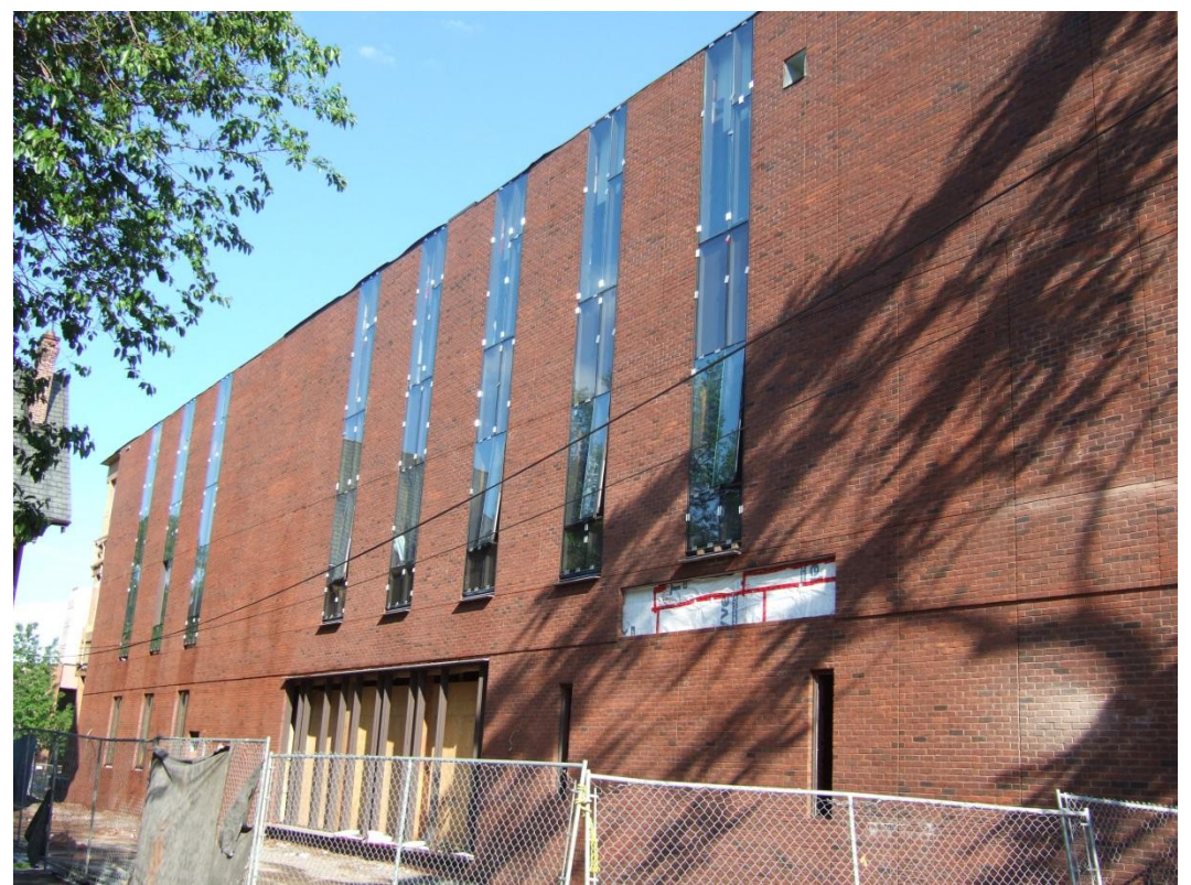
North Wing looking SE from fraternity parking lot, 16 June 2008