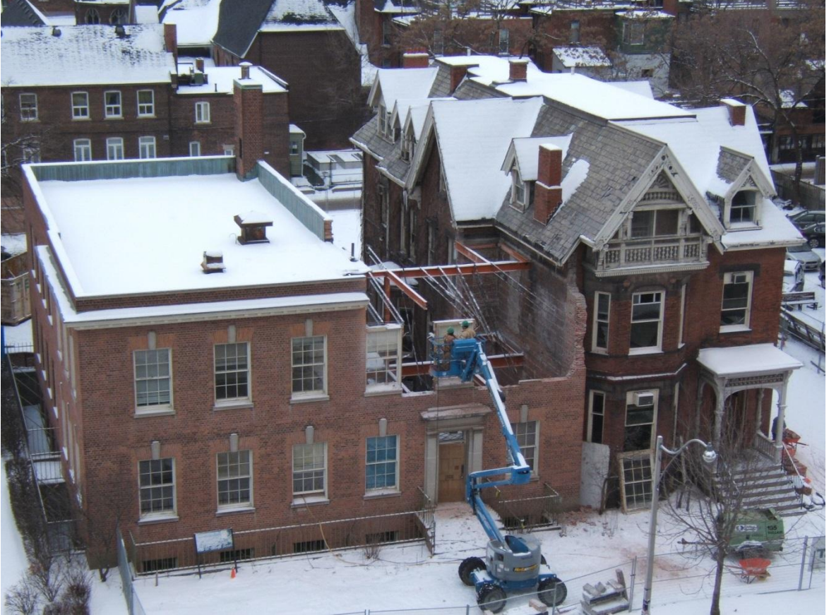
During demolition, from Rotman roof, 30 January 2007.