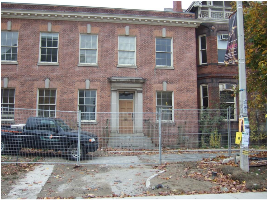
South Addition before demolition of connection