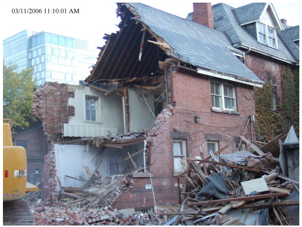
Coach House gone, 1927 addition going, going gone, 7 November 2005.