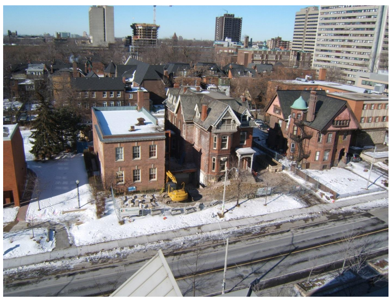
Demolition completed, ready to start construction, February, 2007.