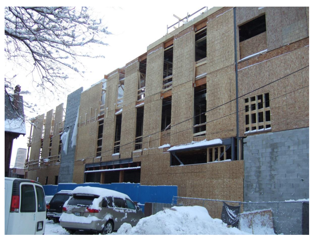
North Wing looking SE from fraternity parking lot, 8 February 2008