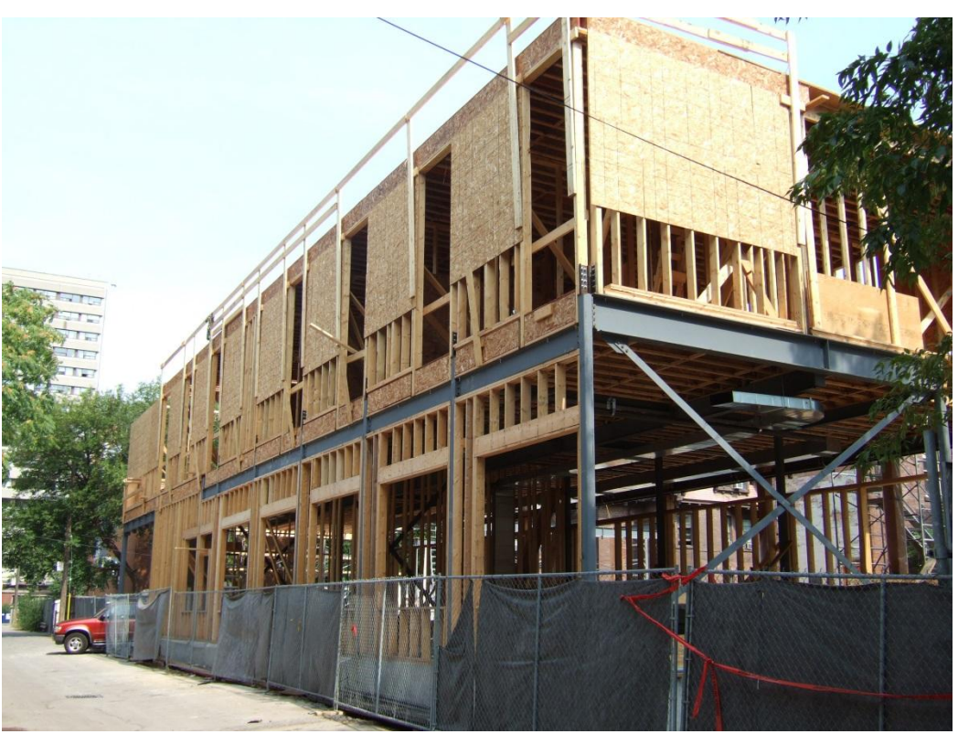
Conference rooms and offices looking NE from lane, 5 September 2007