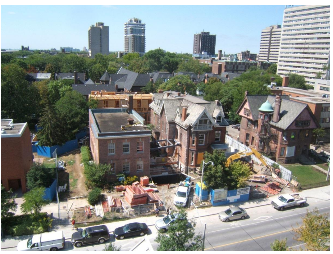
From Rotman Roof, 30 August 2007