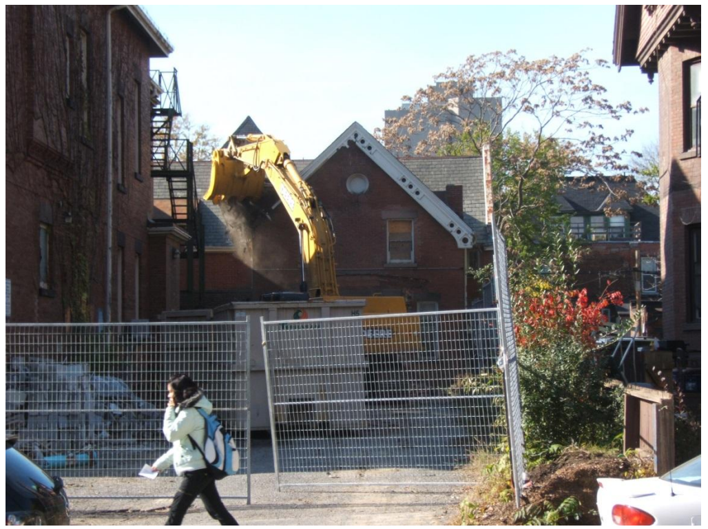
The 'first bite' from the Coach House, 30 October 2005.